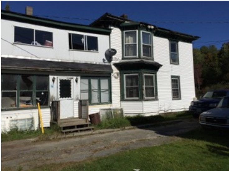
BEFORE (NR #4)