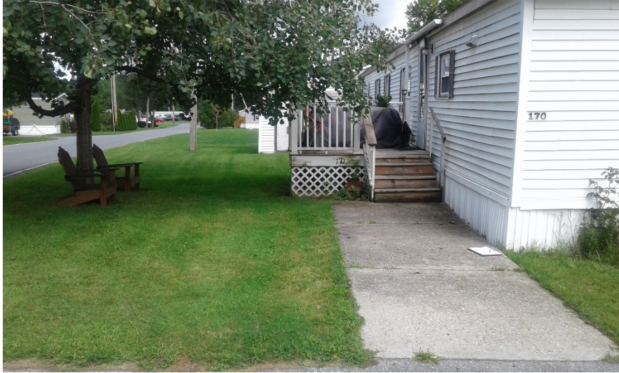
BEFORE (SF #3)