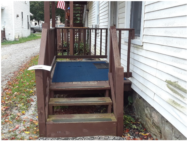
BEFORE (SG #5)