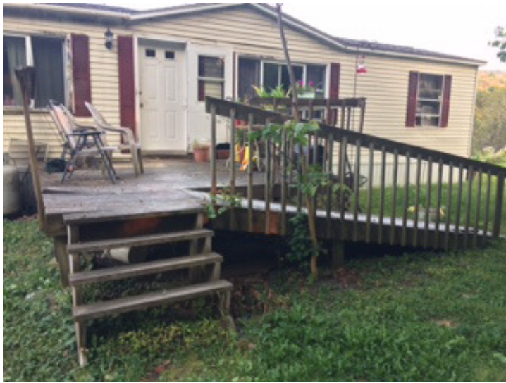
BEFORE (HH #6)